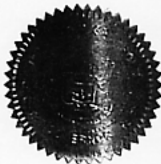
Jennifer M. Granholm Governor

Resolved, That I, Jennifer M. Granholm, Governor of the State of Michigan, do hereby proclaim the week of June 24, 2007, as Pollinator Week in Michigan.